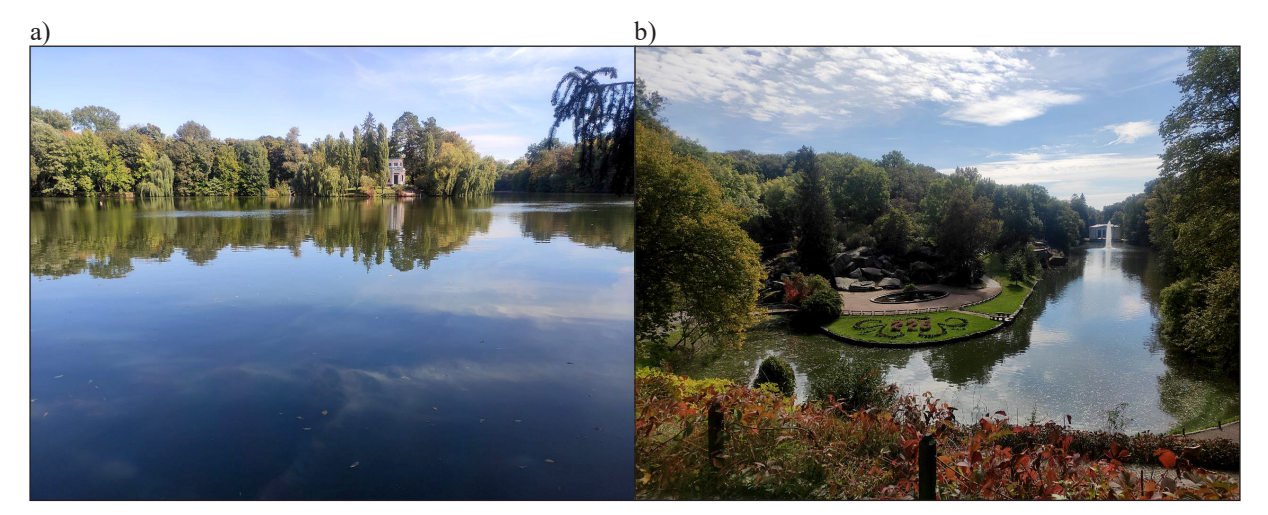
Figure 1. The Upper Pond (a); the Lower Pond (b)

To maintain water pressure when it exits to the Lower Pond, the diameter of the fountain head is reduced three times compared to the diameter of the pipe supplying water. Thus, the height difference (between the height of the water column of the fountain and the level of the Upper Pond) was reduced to 1.5–2.0 m. The construction of this waterway made it possible to decorate the area of the Lower Pond with a large fountain and create a sound effect in the interior of Calypso Grotto.